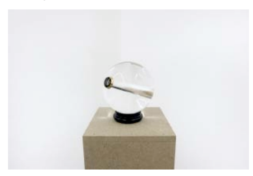
Rodolphe Delaunay Cyclope panoramic [Panoramic cyclops] 2010 Crystal ball, peephole, \varnothing 10 cm