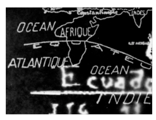
Estefanía Peñafiel Loaiza Work in progress, 2011