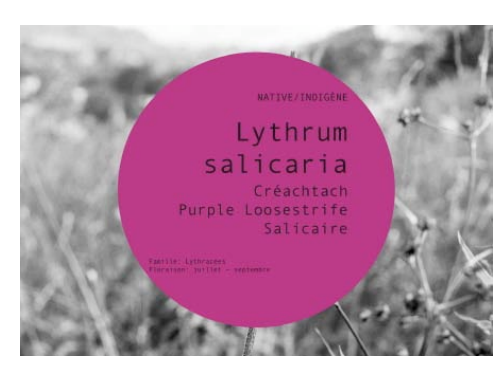
Anne Tallentire, Field Study 1, 2010 Video (4' 30") Courtesy of the artist