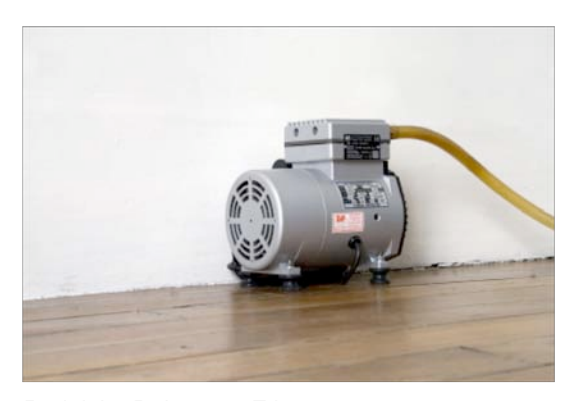
Rodolphe Delaunay, Ether Vacuum pump 15 cm x 20 cm x 21 cm