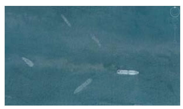
Julie Béna Marines, 2010 Series of 4 photographs Google Earth images 43 cm x 30 cm each Printing on baryté paper