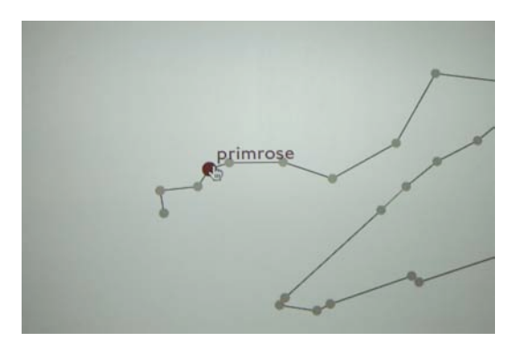
Anne Tallentire, Nowhere else (detail) 2010 Interactive projection Courtesy of the artist